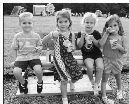
Goosehill Picnic: The annual "Welcome Back Picnic" was held on September 14th to the delight of both students and parents. Bounce houses, music, pizza and fun were enjoyed by all. Definitely a family favorite event. Thank you GPFA!