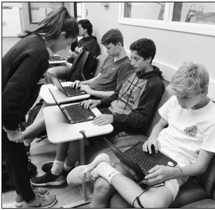
Students enjoying the new flexible furniture in the Computer Science Lab...