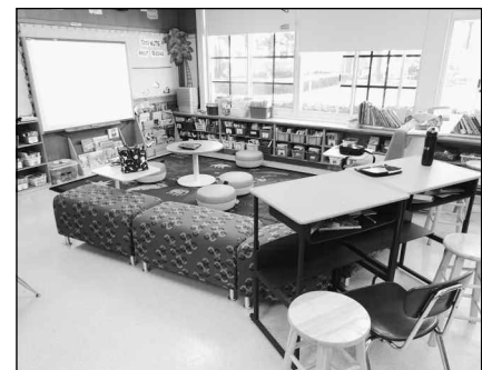
Lloyd Harbor 5th graders love their choices for new seating each time they enter the classroom...