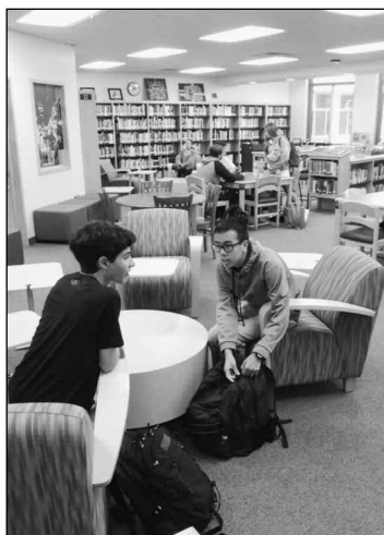
Senior High Library...