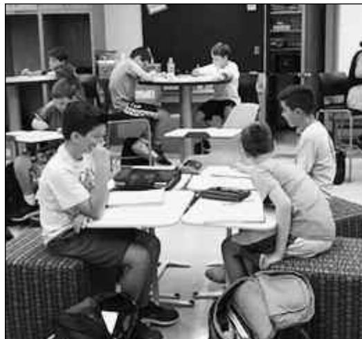
West Side 6th graders enjoy their new furniture. One student said, “I feel like I’m at Panera!”