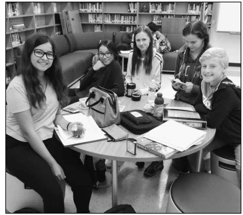
It's all smiles with the new flexible furniture in the Junior High Library NEST...